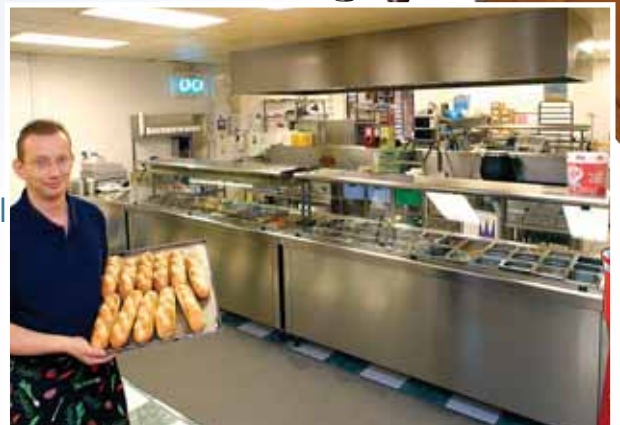
The Continental Servery System with stainless steel finish in use at Sandwich Excel, Carlisle

To help you to create your individual scheme, Breezecool offers an online planning service. Simply send us the dimensions of your service area, together with your servery requirements, by fax or email. We will produce a design and written quotation to fit your establishment's needs.