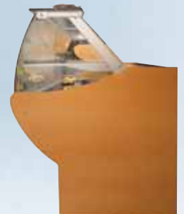
High glass format for the display of patisserie products