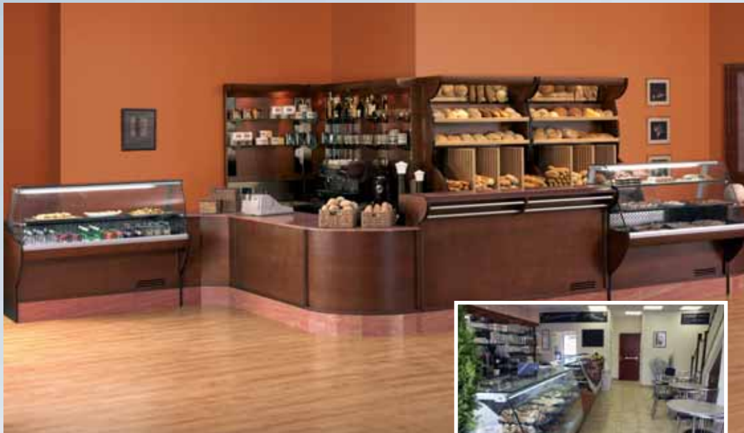
The Decoration K system in use at Townsend Place, an upmarket café bar in Kingswinford, West Midlands.

Decoration K is a simple yet stunning design, with plain wooden panels in a choice of 3 wood veneer finishes, granite worktops with matching plinths and anodised aluminium decorative rails. You can select from a wide variety of shelving modules and back bar storage units to create both a practical and superior scheme.