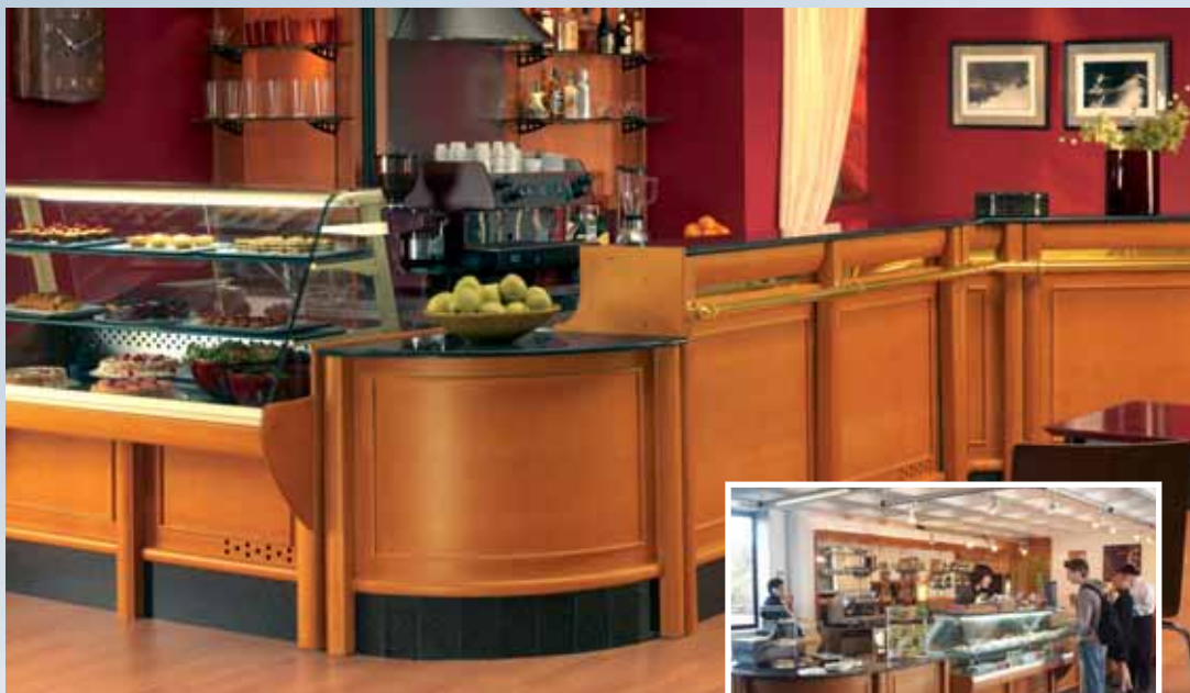
Decoration L has been used to transform an old-fashioned and unprofitable café bar at Heriot Watt University in Edinburgh

Decoration L has a classical design, with curved wooden pillars and decorative wooden panels. This stylish finish can be complimented beautifully by gold-plated rails and gold effect trimming for the glass display cases. In addition, the worktops and plinths offer a choice of vibrant granite or composite stone finishes.