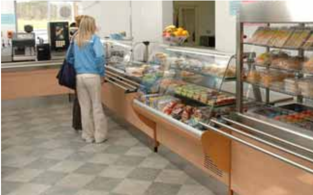
The Continental Servery System with K Wood beech trim in use at Clackmannan College, Scotland

The Continental Servery System is available with optional decorative front panels in stainless steel, wood veneers or lacquered finishes with a choice of RAL colours.